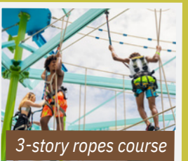
3-story ropes course