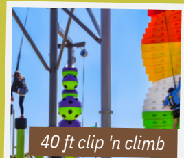
40 ft clip 'n climb